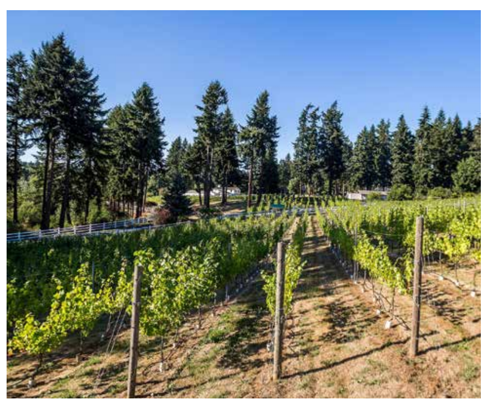
Abbe Vineyard Winery

The Greater Federal Way Chamber of Commerce identified destination management as a key component to attracting, retaining and expanding business and the workforce those businesses support as part of its Vision 2025 project, announced in August 2017.