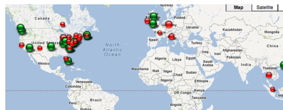
Figure 1: Twitter users who tweeted about #asist2011 are shown in green color

Conferences, workshops, and symposiums are key events during which ASIS&T members from around the world are able to come together to network and disseminate information. Twitter is a tool that is frequently used during such events, and as a result is able to act as a catalyst in networking and informational exchange endeavours. Often, conference facilitators develop conference based hashtags that allow all conference related tweets to be consolidated under one searchable term. For example, for ASIS&T's 2011 Annual Meeting, the hashtag #asist2011 was used. Figure 1 displays Twitter users who posted about #asist2011. Examining the map it is clear that this hashtag was used by scholars from around the world, signifying that an international audience was present or followed this event online.