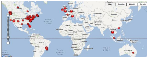
Figure 2: Sample of ASIS&T Twitter users who tweeted during January 2012