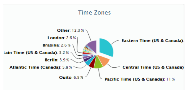
@sig3i Followers by Time Zone

with most tweeting from the Eastern, Central, and Pacific zones.