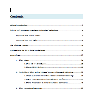
ASIS&T SIG-III'S 30th Anniversary Commemorative Publication

In this anniversary publication, current and past SIG-III officers attempt to capture some of the SIG-III activities and highlight the challenges as well as the successes that the ASIS&T community has had during the past 30 years.