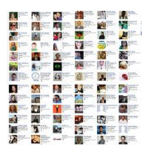
SIG-III Facebook Members

welcoming place where SIG-III members and friends share news and discuss various topics related to the SIG's events and members' activities around the globe.