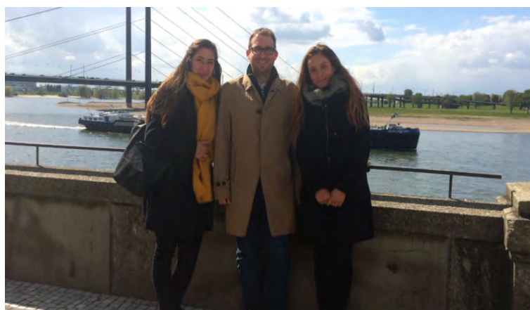
Düsseldorf's Rhine esplanade