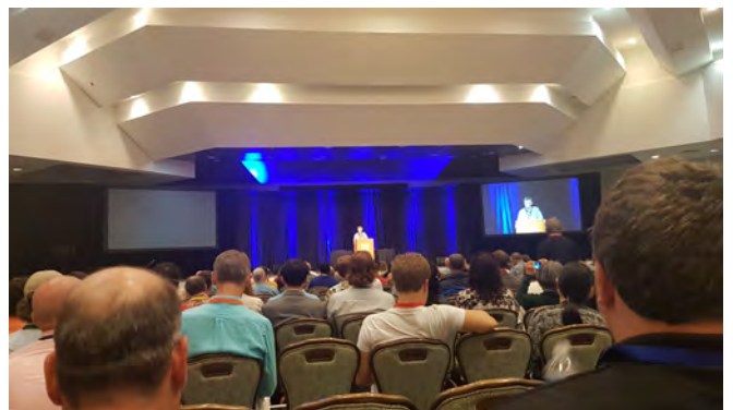
Conference atmosphere at the 50 th HICSS in Big Island, Hawaii

I presented a conceptual framework on smart cities entitled with Informational Urbanism, a project in collaboration with my colleagues from Düsseldorf. The basic idea is that there have been prototypical cities of the industrial society as well as the service society. We are investigating if today – with more than half of all citizens living in cities – there are also prototypical cities of the knowledge society. With our multidisciplinary approach we are interested in several essential characteristics of smart cities and formulated several indicators for each aspect. In my presentation I concentrated on our finding regarding the e-Government in smart cities.