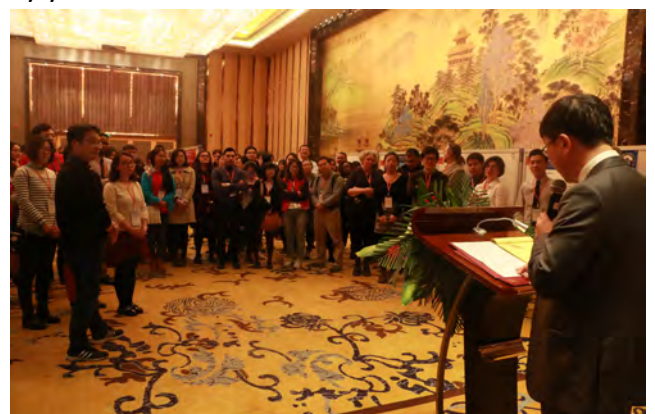
Poster session at the iConference 2017 in Wuhan, China

Be brave to talk to people and be confident to express yourself. It is a great opportunity to meet different scholars at an international conference. Try your best to listen more and ask more.