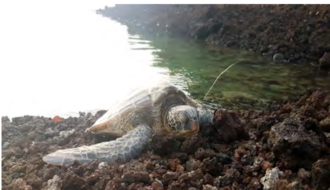
The beauty of Big Island, Hawaii

The 50 th Hawaii International Conference on System Sciences (HICSS). In 2017 the conference was held at Hilton Waikoloa Village, Big Island, Hawaii. Surrounded by beautiful flowers, sea turtles and great food, this conference mediates a very relaxing atmosphere and offers a wide range of interesting topics.