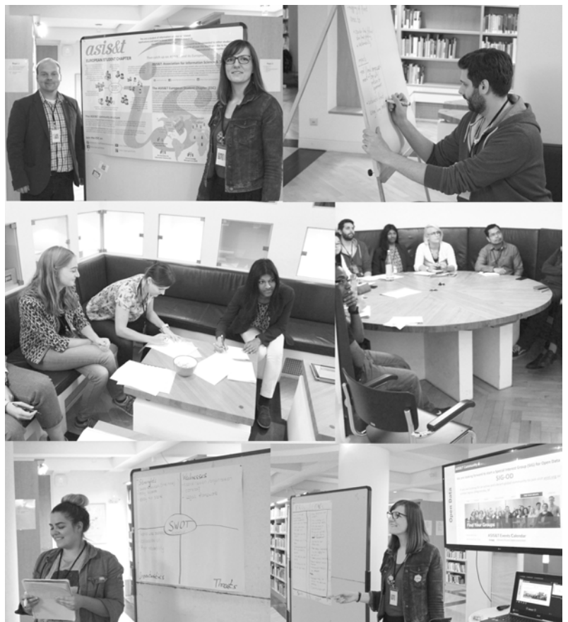
Open data workshop participants at the “Open Southeast Asia” in Bonn, Germany