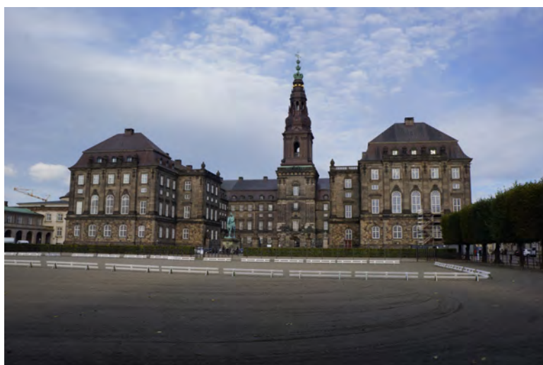
Tourist Tour: Christiansborg in Copenhagen