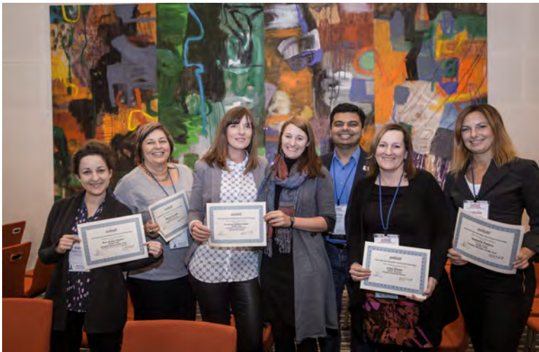
Chapter Awards in the Chapter Assembly