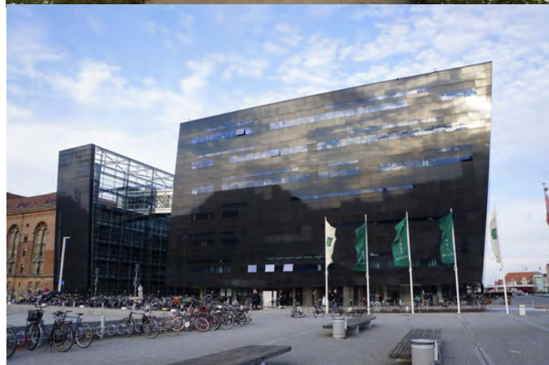
The historic and the modern part of the Royal Library of Copenhagen

The next stop of our tour was the Royal Library of Copenhagen which is a combination of the National Library of Denmark and the Copenhagen University Library. Being the largest library in the Nordic Countries, the building is a fusion of a historic part from 1906 and a modern building from 1999, called the Black Diamond.