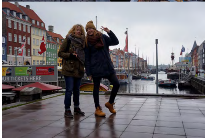
Saying goodbye to Copenhagen