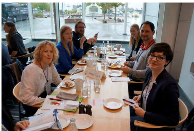
New Member and First Conference Lunch

Thus, come and join this awesome community next year in Washington, D.C.!