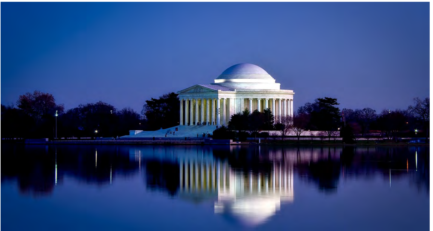
Jefferson Memorial, Washington D.C.

The miniBARcamp was an attempt to represent the ASIS&T community in Copenhagen and to invite people who are not yet in our community. We would love to see continuing the miniBARcamp in the following years to promote the community of ASIS&T at the city where the Annual Meeting is held. Thus, we are looking forward to meet next year with professors, students, and practitioners in Washington, D.C. for a joyful miniBARcamp one evening before the 80 th Annual Meeting of ASIS&T.