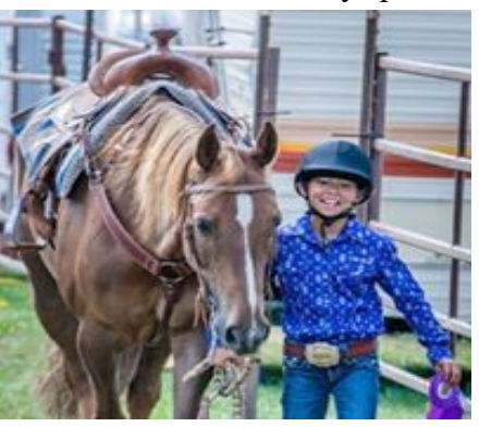
Be the Ribbon Sponsor!