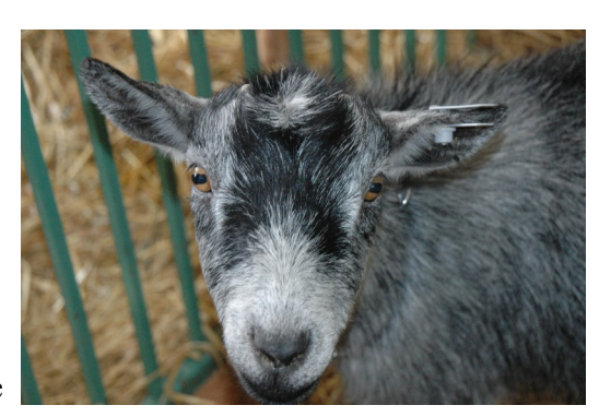
It's Show Time for this Goat!