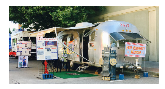
Sponsor The Museum of Curious Things Exhibit!