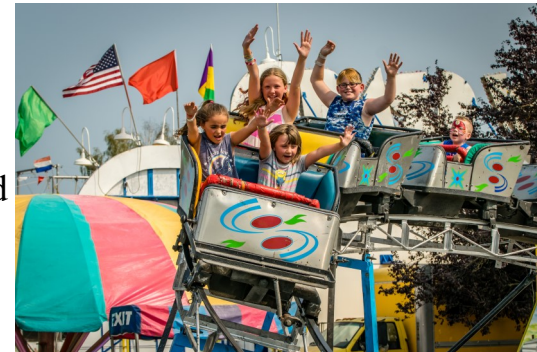
The Heart of the Fair... Families enjoying their time together.

The 2018 Fair saw many successes, and we are confident this momentum will carry into the 2019 Fair. We will be "Bringing Ewe Shear Entertainment" at the 2019 Skagit County Fair, which will take place August 7th