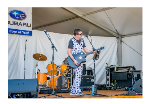
Sponsor a Band!