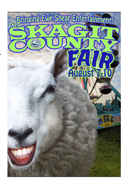
Bringing Ewe Shear Entertainment!!