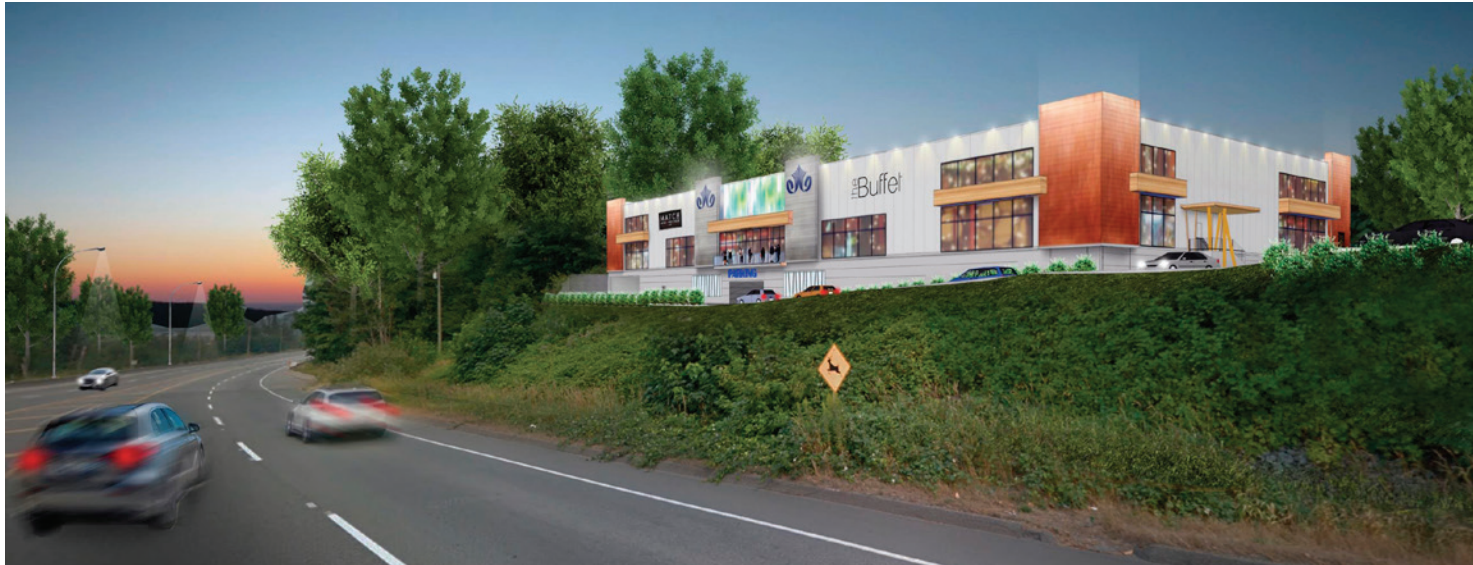
Artist's rendering of proposed 30,000 square foot Gateway casino and The Buffet and MATCH restaurants/sports bar across the highway from Mission RCMP station. Relocation project from existing Chances Mission will create up to 100 new jobs.